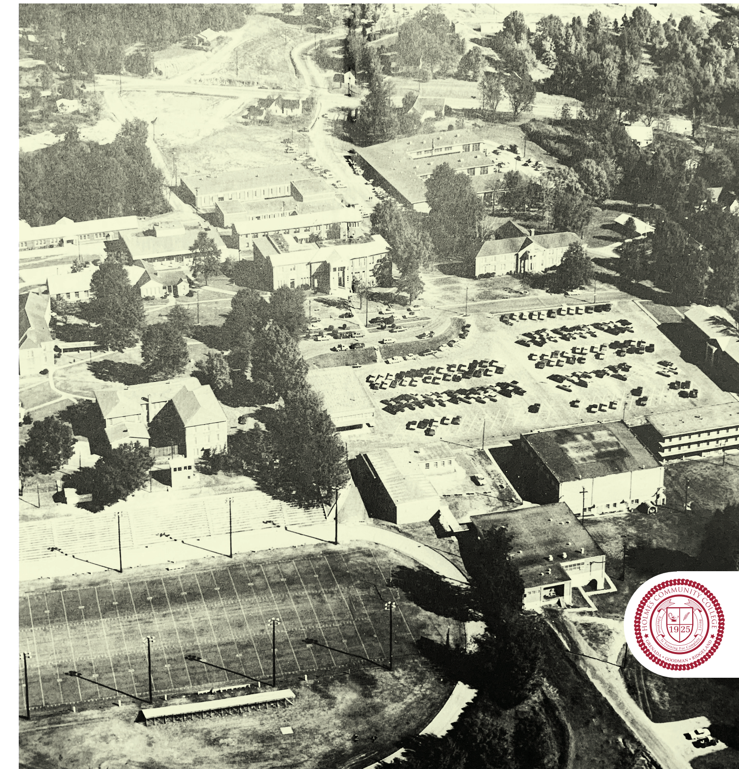
Holmes Community College 1971 | Goodman Campus