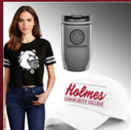
District Scorecard Crop Tee - Black / White