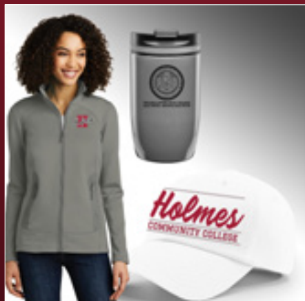
Eddie Bauer Highpoint Fleece Jacket - Metal Grey