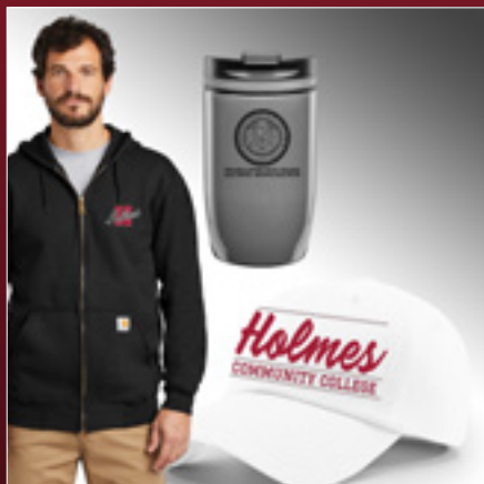
Carhartt Midweight Hooded Zip-Front Sweatshirt - Black

Purchase in the same cart as your alumni dues in our Alumni Community. See pricing: holmesccalumni.360alumni.com/campaigns