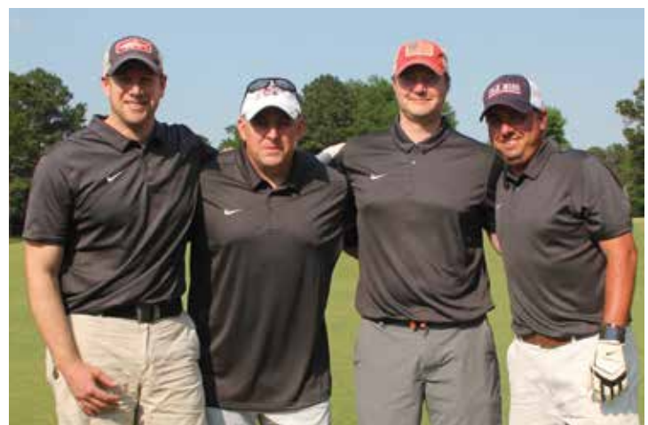
3rd Flight Winners: HCC Soccer