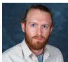
Dace Ruthven Renasant Bank Completion Scholarship