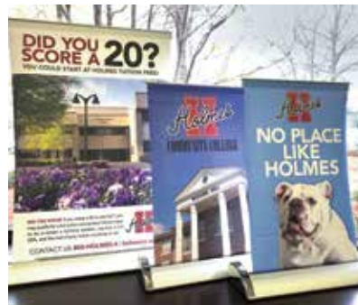
Bronwyn Martin, Recruiting

Purchase of projector, digital screen, and sound system to enhance instructors' i-pad lectures $10,801.00