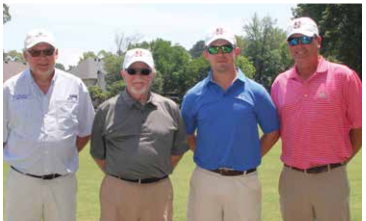
2nd Flight Winners: North American Coal Corporation