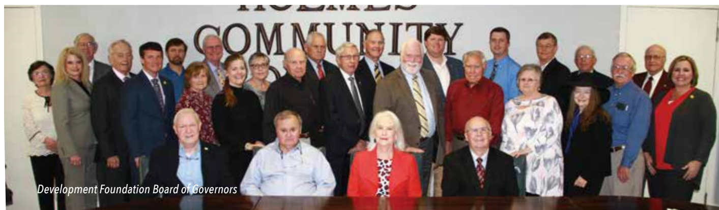
Development Foundation Board of Governors