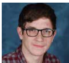
Drayton Spell Hunter Engineering Welding Scholarship