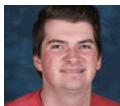
Casey Cloninger Anonymous Scholarship