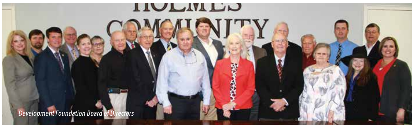
Development Foundation Board of Directors