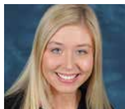
Sara Carpenter Anonymous Scholarship