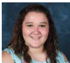
Kendall Preston F.C. & Annie P. Dailey Memorial Scholarship