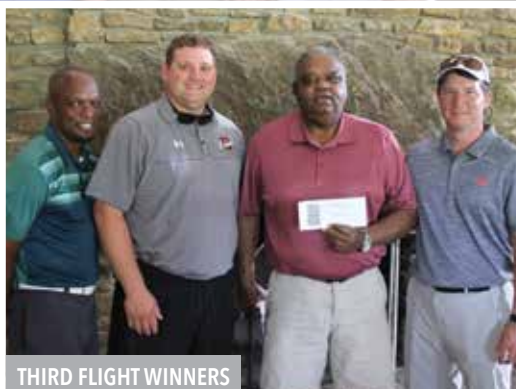
THIRD FLIGHT WINNERS