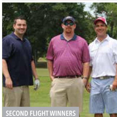
SECOND FLIGHT WINNERS