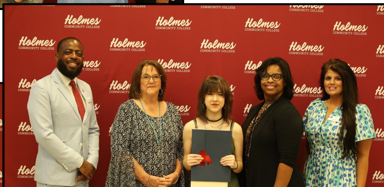
Pictured above: Crossroads Ministries Honoree and supporters