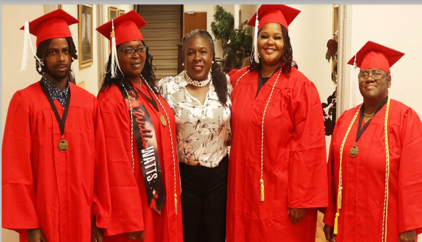
Graduates from the Yazoo City Campus