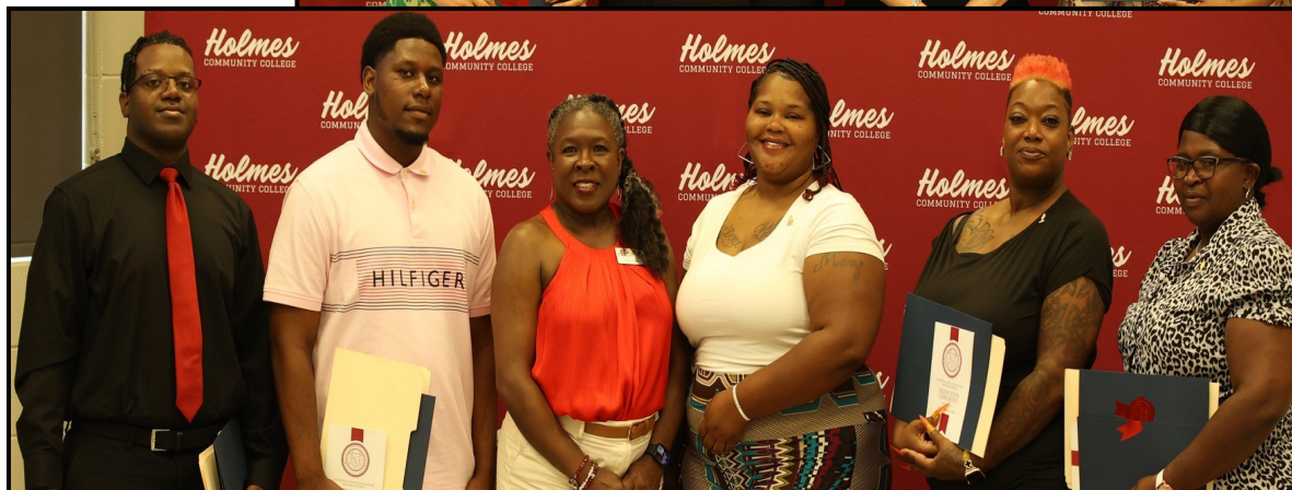
Pictured above: Ridgeland Honorees and Instructor