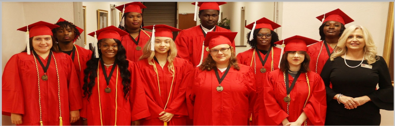
Graduates from the Ridgeland Campus