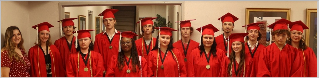
Graduates from the Attala Campus